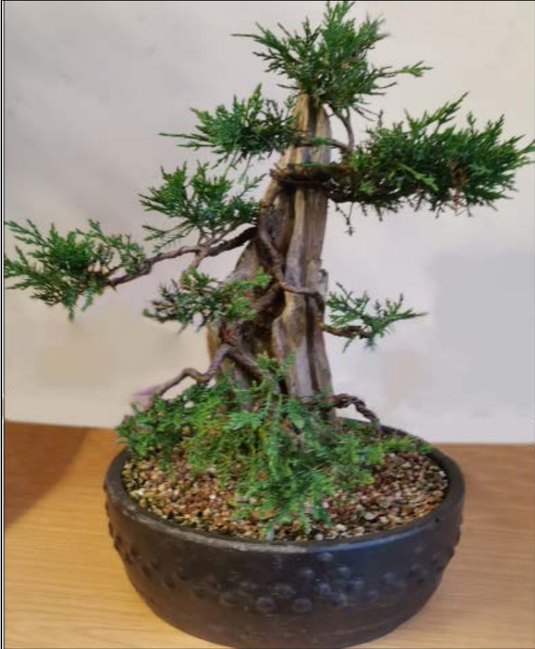
Juniper horizontalis – Tanuki Style - Nigel

An early stage of styling with the trunk needing to be thickened to fill the groove of the donor wood by encouraging maximum growth.