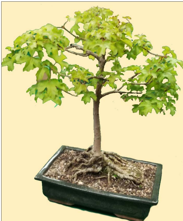
Richard M's Field Maple

Perhaps a different pot of a yellowy or beige colour to show greater contrast to the foliage.