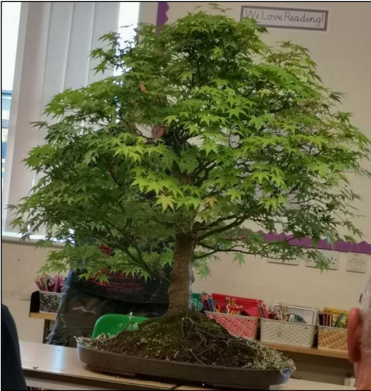
Tony's massive Acer

This is currently a huge tree! The branches need to be taken back hard to produce further ramification but only in spring time whilst the sap is rising.