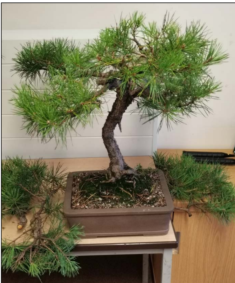
Scots Pine – Richard

Stainless steel screws need to hold tree into the gap to prevent it growing outwards.